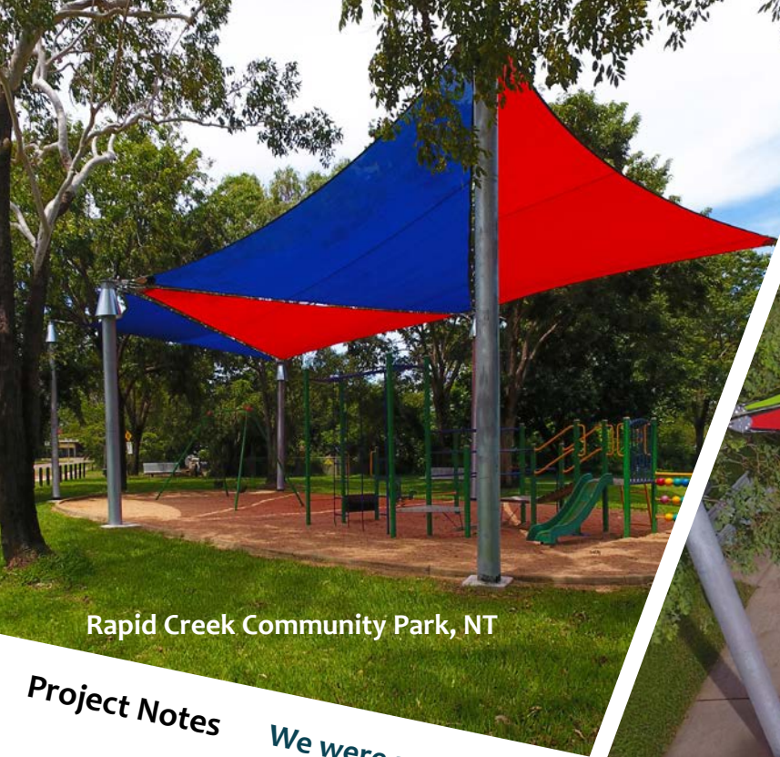
Rapid Creek Community Park, NT