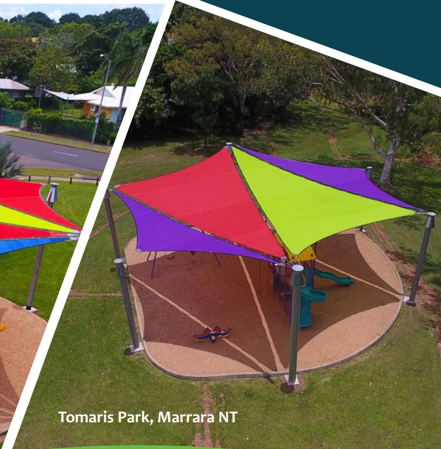
Tomaris Park, Marrara NT

527 Great Western Highway, Marrangaroo NSW 2790 101 Pruen Road, Berrimah NT 0828