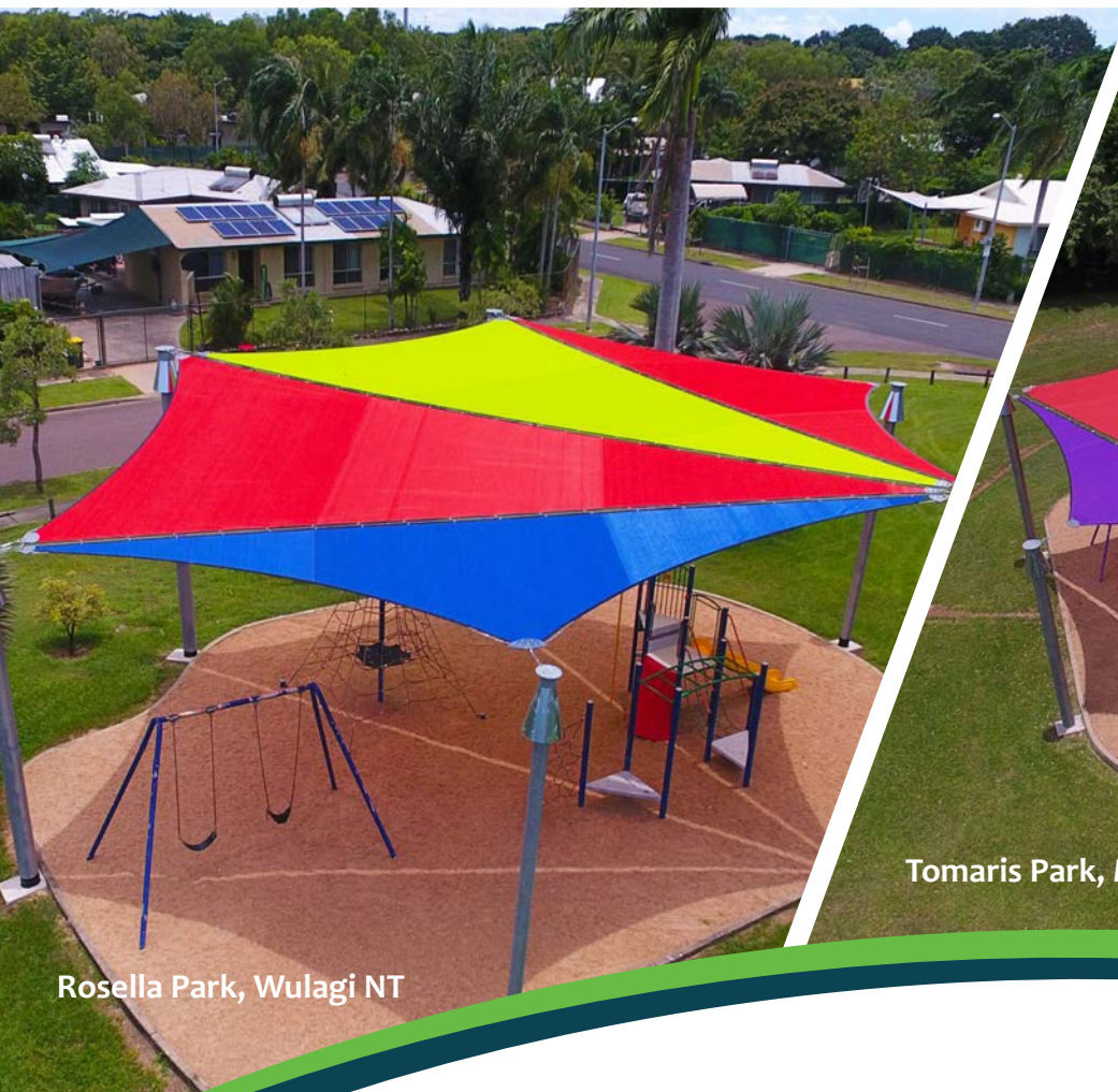
Rosella Park, Wulagi NT

Project Darwin Community Parks Client Darwin City Council Location/Address Darwin Suburbs Frame Colour Hot Dip Galvanised Membrane Type Architec 400