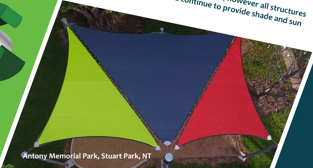
Antony Memorial Park, Stuart Park, NT